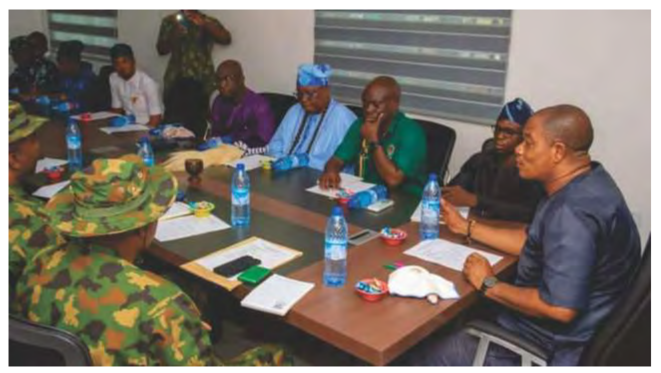
Onilude having a meeting with the security officials

Participants at the meeting deliberated on Nigeria's current economic realities, inflation, food hoarding, a recent indefinite ban on the exportation of grains and other foodstuffs across land borders, measures to be taken to tackle cultism, growing concerns over trafficking, drug abuse among other salient security matters. The stakeholders at the meeting affirmed their commitment to continue to synergize, explore every avenue for peaceful resolution when the need arises, and also continue to promote values that will entrench